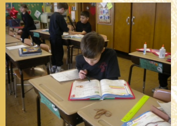
Proud Tradition of Excellence